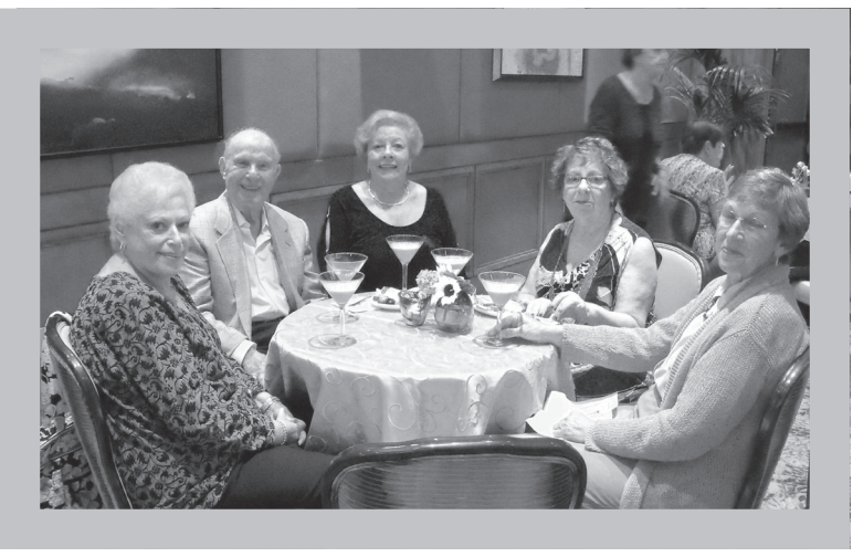
All attendees enjoyed the annual recognition luncheon.