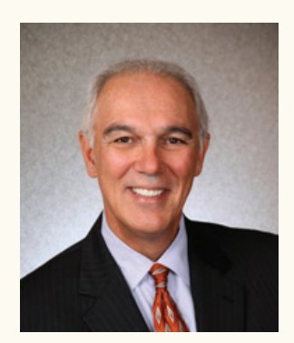
Letter from the President

Welcome to the latest edition of Making Rounds . I am confident that in the following pages you will find information that is useful in your healthcare decisions and will broaden your knowledge of our capabilities and quality of care.